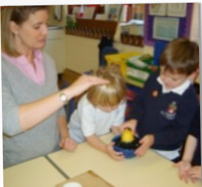
SQUEEZING AND JUICING