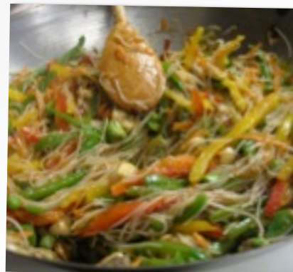
SIMPLE STIR FRY