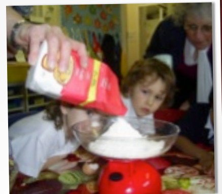
MEASURING AND WEIGHING